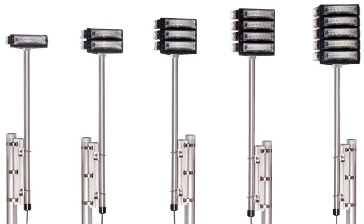
SL-180 Outdoor Stacklight Product Line

Choice of flash pattern allows annunciating different levels of alert within the same color, for example: red steady-on, red single flash, red double flash.