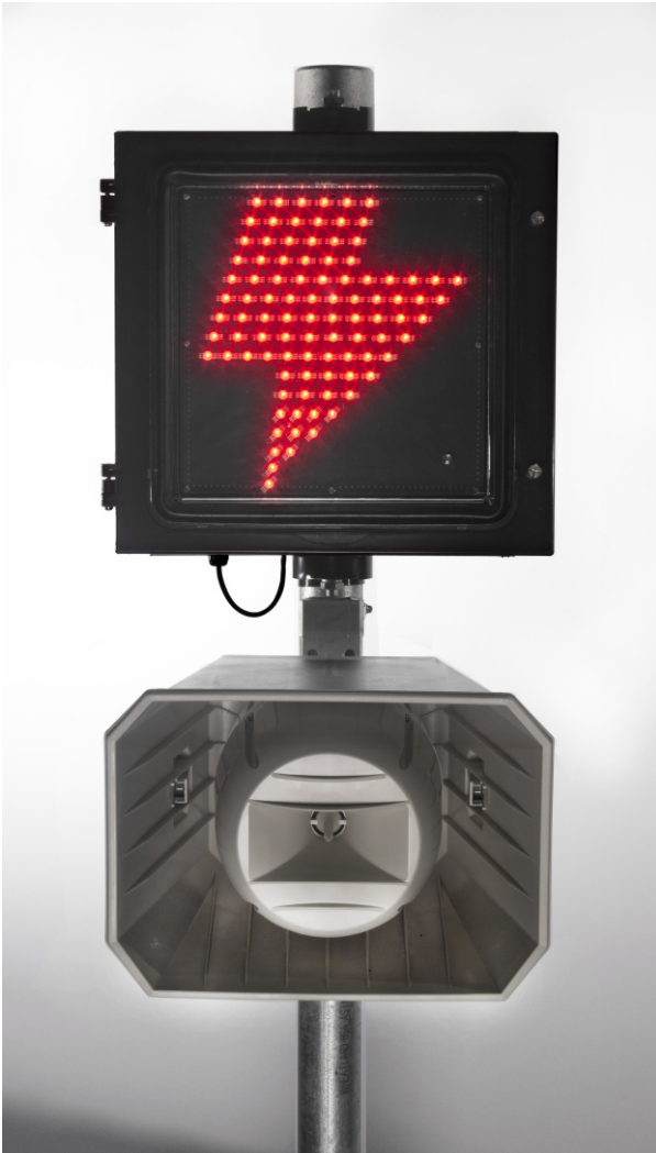
Bolt-260-RYG shown with speaker